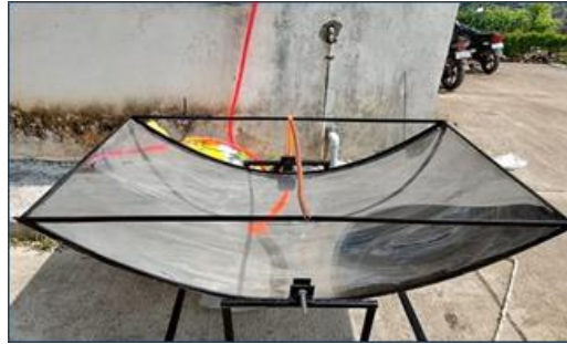
Fig.1 View of Parabolic Trough Collector